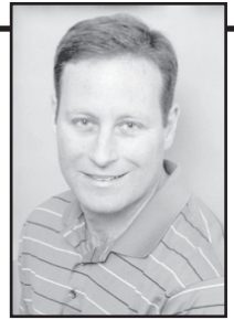
By Dr. Brett Gottlieb, D.C.

N ucca is a procedure that can stop your migraine headaches forever because it eliminates the root cause. This cause is a blockage that occurs in where the head joins the top of the spine. This blockage is disrupting the function of the autonomic nervous system, which controls blood flow throughout the brain and body. This blockage can drop serotonin levels. Low serotonin levels are found in people who suffer from migraine headaches. The trigeminal nerve is located in the brainstem as well. This is the 5th cranial nerve and is thought to play a role in causing migraine headaches.